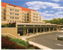
Monmouth Medical Center, Southern Campus