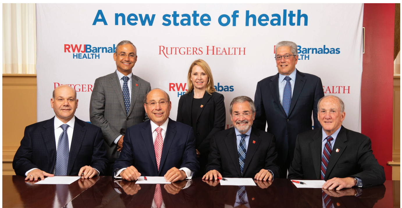
RWJBarnabas Health and Rutgers announce public-private partnership.