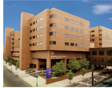
Newark Beth Israel Medical Center and Children's Hospital of New Jersey