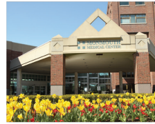
Monmouth Medical Center and The Unterberg Children's Hospital