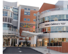
Children's Specialized Hospital