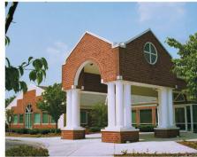
Barnabas Health Behavioral Health Center