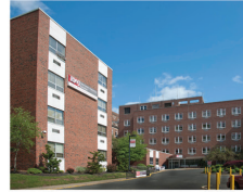
Robert Wood Johnson University Hospital Rahway