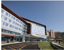
Saint Barnabas Medical Center