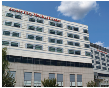
Jersey City Medical Center