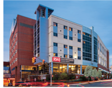
Robert Wood Johnson University Hospital and The Bristol-Myers Squibb Children's Hospital