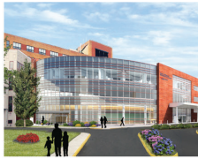
Clara Maass Medical Center