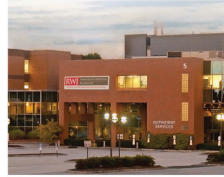
Robert Wood Johnson University Hospital Hamilton