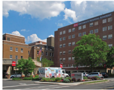
Robert Wood Johnson University Hospital Somerset