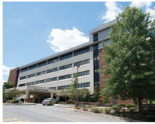
Community Medical Center