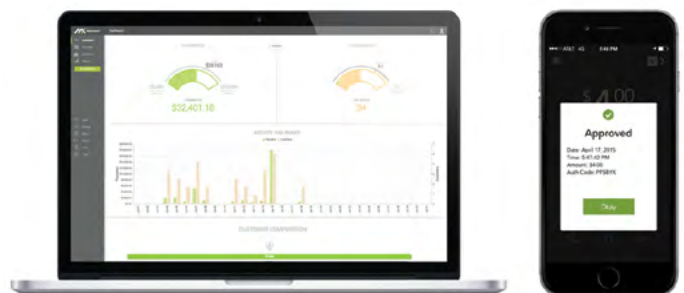
Pictured: MXMerchant (laptop), MXExpress (iPhone)

Services provided by Priority Payment Systems Local. The Priority Payment Systems name, trademarks, logos, service marks and taglines are owned by Priority Payment Systems LLC. All other trademarks and trade names referenced in this material are the property of their respective owners. The Priority independent reseller and sales agent program is operated by Priority Payment Systems, LLC. Priority Payment Systems LLC is a registered ISO of Wells Fargo Bank N.A., Walnut Creek, CA, a registered ISO/MSP of Synovus Bank, Columbus, GA and a registered ISO of BMO Harris Bank N.A., Chicago, IL. Priority Payment Systems is a participant of the American Express Opt Blue® Program. American Express® may require separate approval. Priority Payment Systems Local is an independent contractor of Priority Payment Systems LLC.